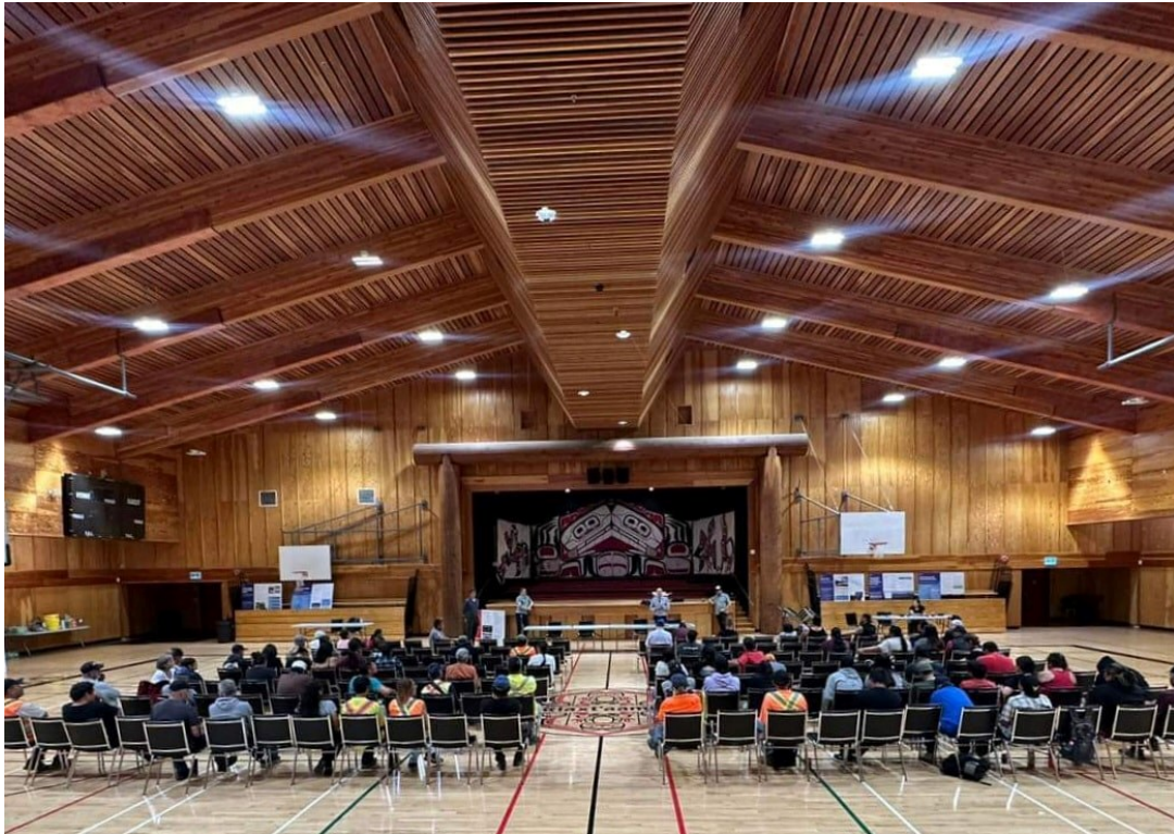
PRGT jobs and information session, June 2024

Over the past decade, PRGT has consulted extensively with the Nisga'a Nation.